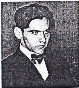
Federico Garcia Lorca